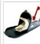
Postal Delivery Service

The entire Web Mall is completely flexible and extensible. Any feature, product or category may be edited or omitted to meet your specific needs.