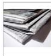
Carrier Delivery Service